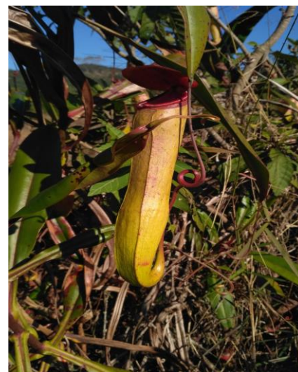
Nepenthes khasiana (location- Lawbah West Khasi Hills District)

Medicinal Plants are an important source of raw materials for traditional medicine and other plant based medicine. The people depend upon local medicinal plants for their primary and immediate health care needs. These plants could be either the cultivated plants in their homesteads, farmlands, cultivation fields or wild plants from forests. The formulations made of these medicinal plants are used for primary health care like cuts, wounds, cough, pain, stomach problems, liver disorders etc. The parts of the plant in use could be leaves, fruits, roots or stems as per their suitability to cure ailments. The supply base of herbal raw drugs used in the manufacture of Ayurveda, Siddha, Unani and Homoeopathy systems of medicine is largely from the wild. Since the wild sources is speedily shrinking it has been a felt needs for conservation and sustainable supply of of medicinal plants for plant based medicine.