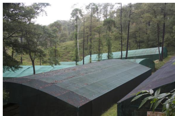
Nursery site at Mawiaban , Nongstoin, West Khasi Hills District

During 2014-15, the National Medicinal Plants Board has become a part of the National AYUSH Mission under the Ministry of AYUSH Govt. of India, New Delhi. The main objective is to promote AYUSH medical system through cost effective AYUSH services, strengthening of educational system, facilitate enforcement of quality control of Ayurveda, Siddha and Unani & Homoeopathy (ASU & H) drugs and sustainable availability of ASU & H raw materials. Under the National AYUSH Mission Scheme, the Board has been entrusted with the implementation of the component 'Medicinal Plants' to be taken up in the State. Through this scheme the Board has been taking up activities like nurseries development, cultivation of medicinal plants, training/ awareness programs, etc. The Board is also providing assistance to Local Herbal Practitioners for setting up