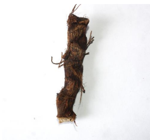
Acorus calamus rhizome (sample collected from traditional healer)