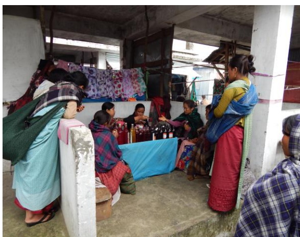
Local Herbal Practitioner at Laitlyngkot Market (year 2015)

In Meghalaya, medicinal plants are an important source of raw materials for traditional medicine used by the Traditional Healers of the State. As per the market survey conducted by the Meghalaya State Medicinal Plants Board, there are minimum of three Traditional Healers in every weekly Market with in the State. Majority of them collected the raw materials from the wild which is in unorganised form and unscientific manner. Capabilities in the form of good cultivation and collection practises, good manufacturing and marketing practises etc. are to be established in the State.